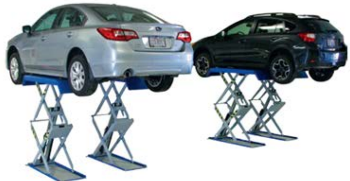
Shown w optional underfloor hoses

Mechanical locking device with automatic engagement and pneumatic release, ensuring maximum safety when lift is in standing position.