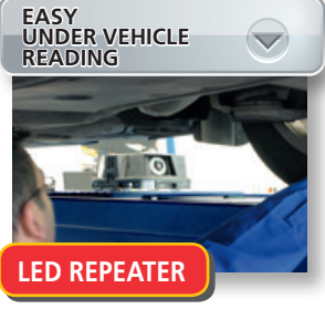
Guided adjustments with no need to see the monitor.